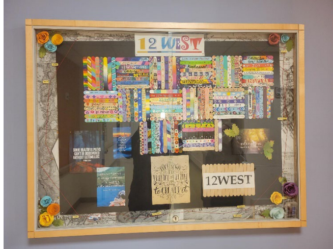
12 West Mott: An example of Compassionate Teambuilding & Self-Care

The Great Awareness: Making small changes to see... A Big Difference in Workforce Wellness